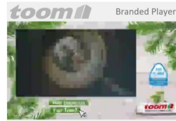
Branded Player complete frame