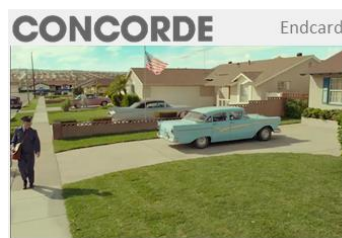
Showtime Roll with Endcard